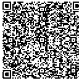
QR code St Peter's