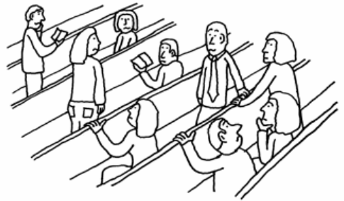
WATCH TO SEE WHAT OTHER PEOPLE ARE DOING