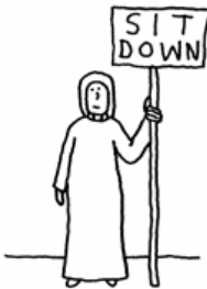
LOOK OUT FOR SUBTLE HINTS GIVEN BY THE CLERGY