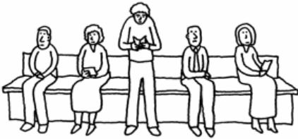
SEE WHETHER IT SAYS ANYTHING IN THE SERVICE BOOK