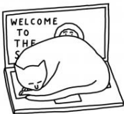
ANIMALS RUNNING AMOK