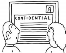
ACCIDENTAL SCREEN-SHARING OF PASTORALLY-SENSITIVE INFORMATION