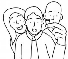
INVASION BY ROWDY GROUP OF METHODISTS