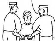
LIVE ARREST OWING TO IGNORING COPYRIGHT