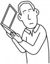
PROBLEMS WITH THE SOUND