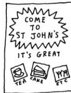
ENVY (RIVAL CHURCHES POACHING OUR CONGREGATION)