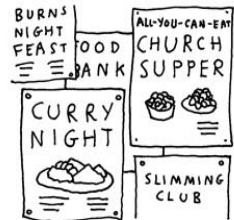
GLUTTONY (OVERINDULGENCE, ETC)