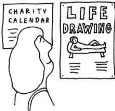
LUST (COVETING THY NEIGHBOUR'S FONT, LAYOUT, ETC)