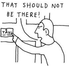
WRATH (DIRECTED AT INVALID ADDITIONS)