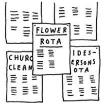
PRIDE (COVERING UP OTHERS' WORK)