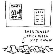
SLOTH (NOT REMOVING OLD NOTICES)