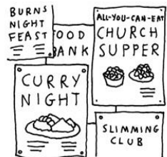
GLUTTONY (OVERINDULGENCE, ETC)