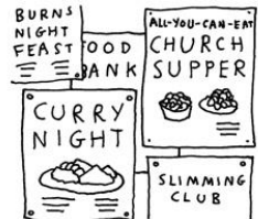
GLUTTONY (OVERINDULGENCE, ETC)