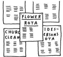
PRIDE (COVERING UP OTHERS' WORK)