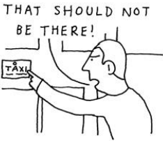
WRATH (DIRECTED AT INVALID ADDITIONS)