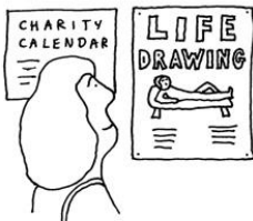
LUST (COVETING THY NEIGHBOUR'S FONT, LAYOUT, ETC)