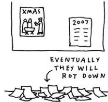
SLOTH (NOT REMOVING OLD NOTICES)