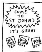
ENVY (RIVAL CHURCHES POACHING OUR CONGREGATION)