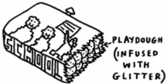
THE SUNDAY SCHOOL

A. THE FILLING DEPENDS UPON WHO HAS MADE THE KNEELER. THESE KNEELERS HAVE BEEN CUT OPEN SO THAT YOU CAN SEE WHAT IS INSIDE: