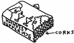
THE SOCIAL COMMITTEE