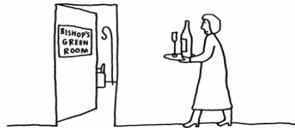
CATERING FOR SPECIAL REQUIREMENTS