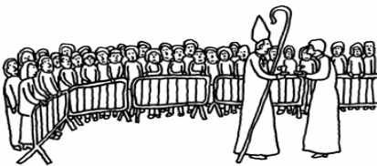
KEEPING UNDESIRABLE ELEMENTS AT A SAFE DISTANCE