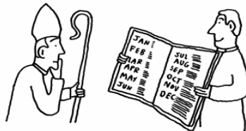
WRITING IN THE BOOKS TO MAKE IT LOOK AS IF THERE ARE REGULAR SERVICES