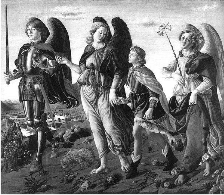
The Three Archangels with Tobias, by Francesco Botticini, 1470, Uffizi Museum, Florence