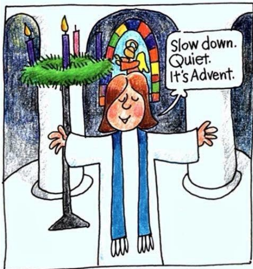
ONE SUNDAY IN ADVENT